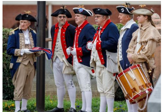
Washington Square, Kettle Creek Celebrations