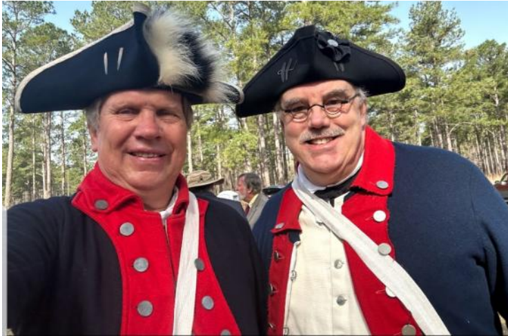
Brier Creek, Sylvania, GA