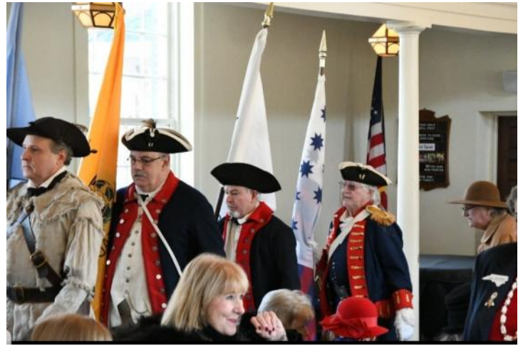
Cowan's Ford, N.C.