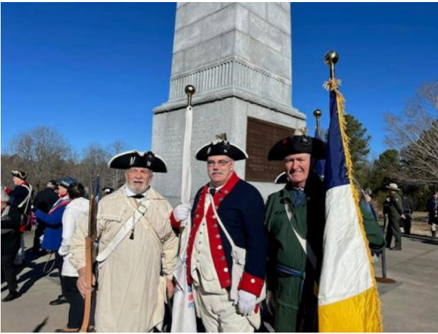
General Morgan's and Cowpens S.C.