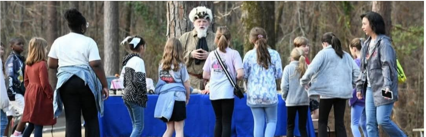
Lincoln Co. students learned of 18th century life, death, and medical treatments at Heroes of the Hornets Nest held at Elijah Clark State Park.