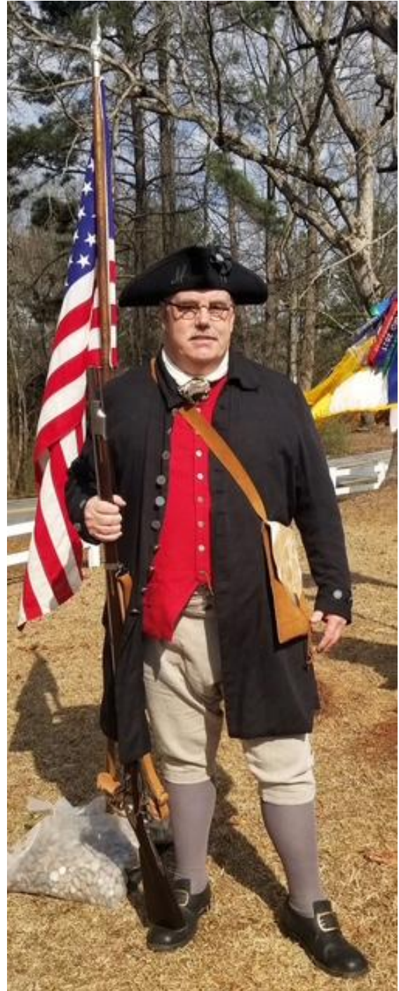
Liberty Tree, Mars Hill Cemetery, Acworth, GA.