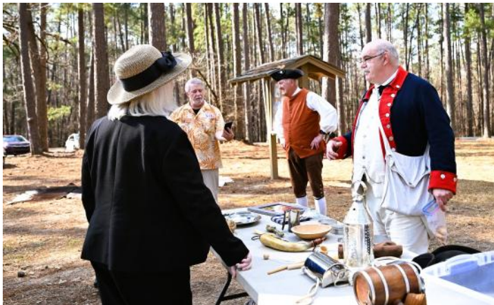
Heroes of the Hornets Nest, Elijah Clark State Park